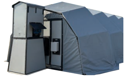
Modular 3 stage NESHAP exhaust system at back of paint booth shelter

Complex has been tested and performance verified to achieve applicable life safety and bio-environmental airflow standards for painting and maintenance operations