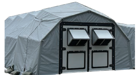
Equipment doors with weather protected adjustable make-up air doors at front of shelter